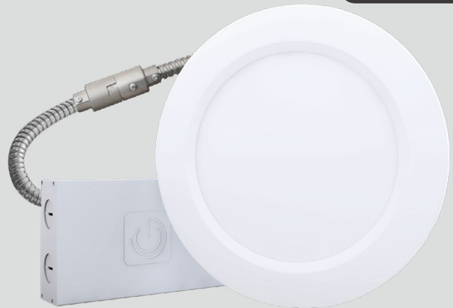
THINFIT 277V EXT

At less than 1.5" deep, the THINFIT EXT family of shallow, 4", 6", and 8" recessed fixtures are a great solution for many commercial and residential downlight applications. The shallow fixture depth makes it ideal for installation into soffits and bulkheads that utilize typical 2x4" construction, and with light output up to 1920 lumens, the THINFIT EXT fixtures are great for higher mounting height applications as well. The wet location, IC and Airtight fixture ratings mean that the THINFIT EXT can be used in shallow bathroom, kitchen and outdoor applications where other fixtures are unable to fit. The THINFIT EXT family of fixtures are a cost effective and attractive solution for many lighting projects.