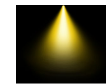
3500K NEUTRAL WHITE LIGHT