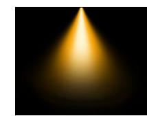
3000K WARM WHITE LIGHT