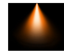
2700K SOFT WHITE LIGHT