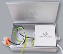
120V Driver Box

The THINFIT EXT family is engineered to make wiring easier than ever before. With its quick connectors , double knock-outs and the large wiring space , it is the ideal companion for daisy chain wiring in accordance with the National Electric Code requirements, or for adding an Emergency unit , making retrofit of any residential or commercial applications a snap. In addition, both the 120V and the 120-277V, with its flexible conduit , have a quick disconnect on the cable that help reducing the installation time even more.