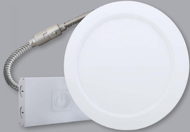
THINFIT 277V EXT

At less than 1.5" deep, the THINFIT EXT family of shallow, 4", 6", and 8" recessed fixtures are a great solution for many commercial and residential downlight applications. The shallow fixture depth makes it ideal for installation into soffits and bulkheads that utilize typical 2x4" construction, and with light output up to 1920 lumens, the THINFIT EXT fixtures are great for higher mounting height applications as well. The wet location, IC and Airtight fixture ratings mean that the THINFIT EXT can be used in shallow bathroom, kitchen and outdoor applications where other fixtures are unable to fit. The THINFIT EXT family of fixtures are a cost effective and attractive solution for many lighting projects.