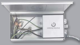
120-277V Driver Box