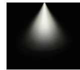
4000K COOL WHITE LIGHT