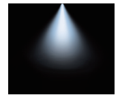
5000K DAY LIGHT