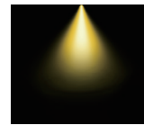
3500K NEUTRAL WHITE LIGHT