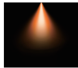
2700K SOFT WHITE LIGHT