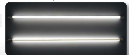
Lamp Back View