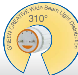
Lamp Front View

This lamp uses an innovative glass design that diffuses heat and light more evenly. As a result of its compact light engine, this lamp produces a light emitting area of 310°. This wider beam angle improves a fixture's total light distribution and creates a more complete lighting effect.