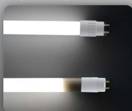
Other LED Tubes