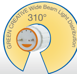
Lamp Front View

This lamp uses an innovative glass design that diffuses heat and light more evenly. As a result of its compact light engine, this lamp produces a light emitting area of 310°. This wider beam angle improves a fixture's total light distribution and creates a more complete lighting effect.