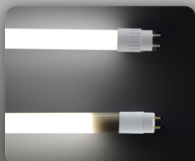
Other LED Tubes