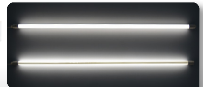
Lamp Back View