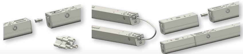
QWIKLINK Connector QWIKLINK Cable QWIKLINK Sensor

Easily and seamlessly connect up to 64' of fixtures with the QWIKLINK connection system. The QWIKLINK connector provides line voltage and 0-10V dimming between fixtures. The QWIKLINK cable comes in two lengths (7.9in. & 5ft.) and allows for angled and distant fixture connection. The QWIKLINK sensor integrates with a single fixture or an entire row for occupancy sensing and dimming.