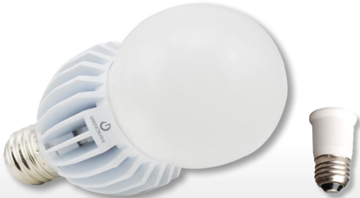
Optional Lamp Extender